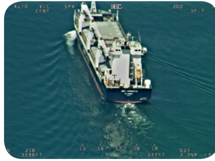
Video interface with onboard cameras Photo Credit: L-3 WESCAM - MX Series