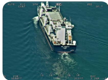
Video interface with onboard cameras